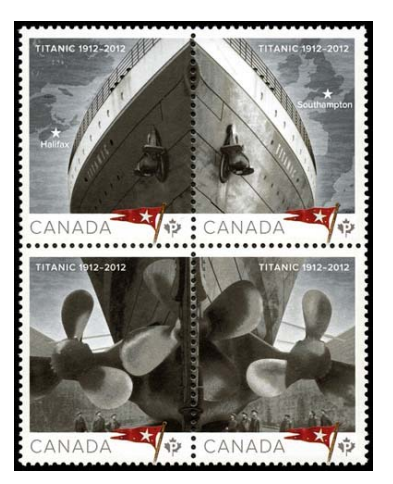
On the Cover...the Titanic

Most people have heard about the sinking of the Titanic although, there are apparently some young people who thought it was just a movie! But no...it was real and it happened one hundred years ago on April 15th 1912. It was a luxury liner, the largest yet to be built and thought to be virtually unsinkable. It was a terrible disaster killing some 1500 people. The miracle is that more passengers weren't aboard. This was RMS Titanic's maiden voyage and there was a lot of hype about it. There was a coal strike in Britain at the time